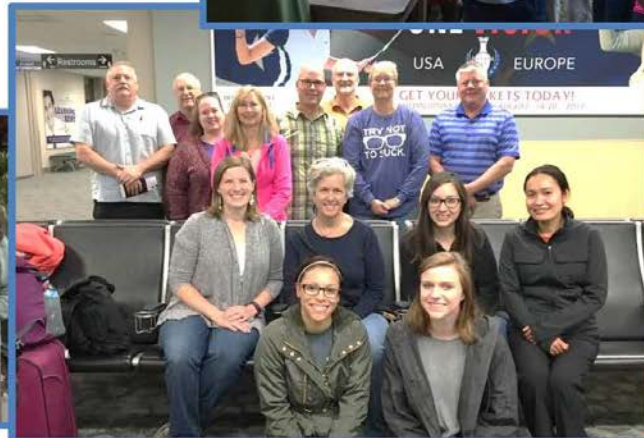
EQUIPO PASTORAL La Casa Pastoral Berlín, Usulután, El Salvador