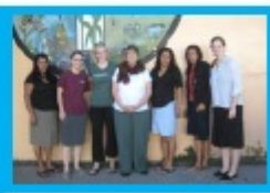
EQUIPO PASTORAL La Casa Pastoral Berlín, Usulután, El Salvador