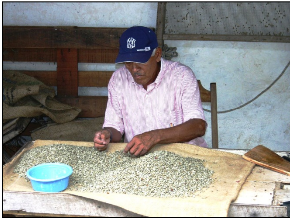
Don Justo beans are handpicked for quality.

Buying coffee through this project also promotes sustainable community and economic development. A large portion of the proceeds go to projects designed and organized by local residents. These projects have included: support for small farmers, maintenance and repair of community structures, food packets and assistance for elderly or others with no other resources. General medical, educational, economic and social justice issues are also addressed with the proceeds.