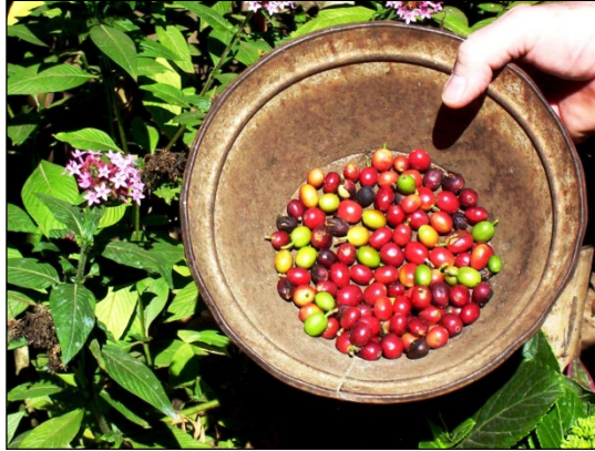
These are coffee "cherries." Inside each cherry are two coffee beans that after fermenting, drying and roasting, are ground and brewed to make the perfect cup of coffee!

But current coffee trading practices make it difficult for farmers to earn a livable wage. Each year exporters, brokers, creditors and processors take a larger share of coffee proceeds, leaving farmers and El Salvador's communities with less than 10¢ of every dollar. But there is an alternative.