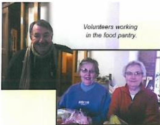
Volunteers working in the food pantry.

Through a partnership with the Des Moines Area Religious Council (DMARC) Food Pantry Network, in 2010 CROSS Ministries opened the first alternative hours food pantry. Recognizing that many of the working poor are unable to access food pantries during standard business hours, the opening of a centrally located evening and weekend pantry, and without geographic boundaries, helped to ensure greater food access for all.