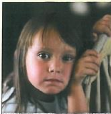
THE POVERTY LINE