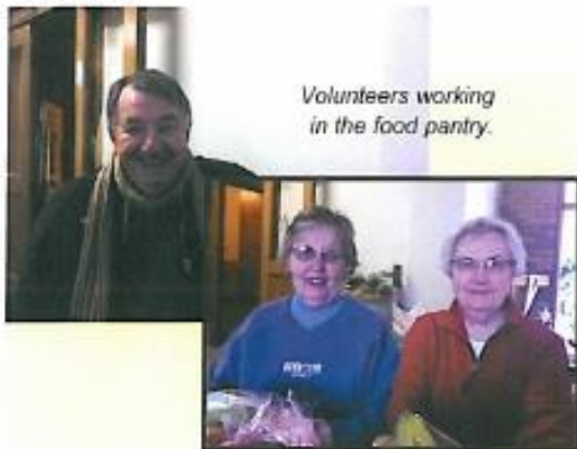
Volunteers working in the food pantry.

Through a partnership with the Des Moines Area Religious Council (DMARC) Food Pantry Network, in 2010 CROSS Ministries opened the first alternative hours food pantry. Recognizing that many of the working poor are unable to access food pantries during standard business hours, the opening of a centrally located evening and weekend pantry, and without geographic boundaries, helped to ensure greater food access for all.