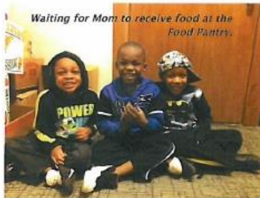
Waiting for Mom to receive food at the Food Pantry.